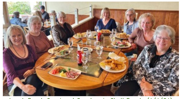
Lunch Bunch 2 enjoyed Spyglass in Shell Beach. (4/4/24)