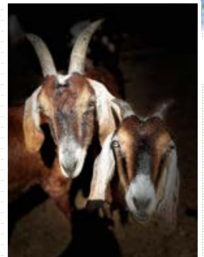
The GGs visited Black Market Cheese Co. north of Paso Robles to discover & taste. (4/18/24)