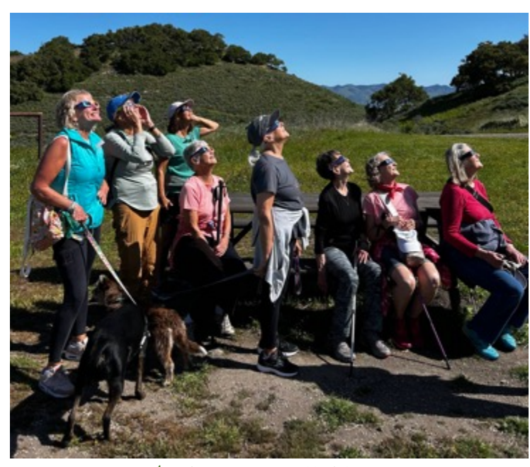
The Women's Hiking Group spotted the solar eclipse while hiking the Pismo Preserve. (4/8/24)