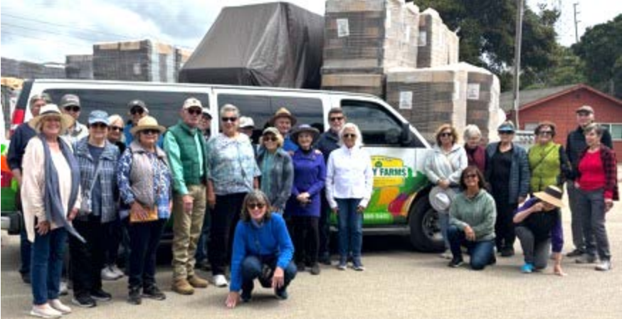
The Talley Farms tour was very informative and was enjoyed by all. (4/25/2024)