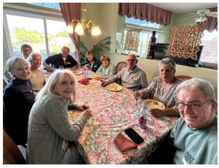
TGIF 2 enjoyed meeting at the Graham's home. (4/26/24)